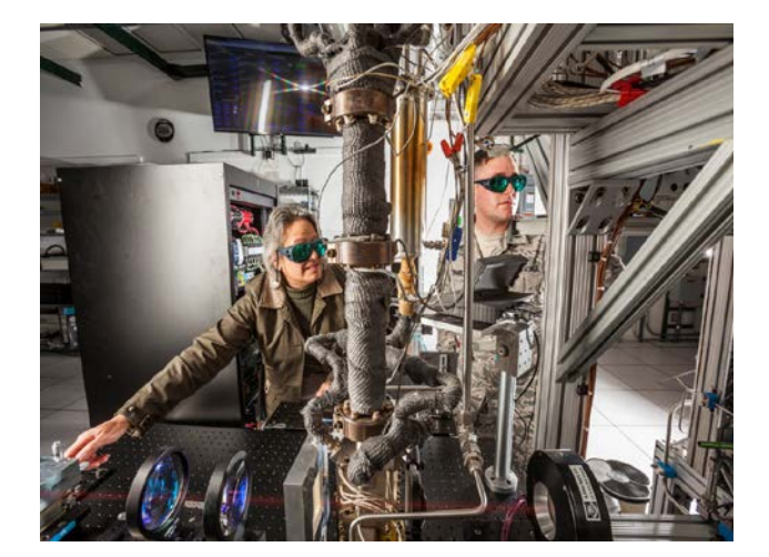
AFRL scientists perform a laser experiment in the Directed Energy Directorate's Diode Pumped Alkali Laser laboratory.

The directorate is organized into divisions by major technology area. Often research capabilities are drawn from several divisions as well as across the whole of AFRL. The four technology divisions are: