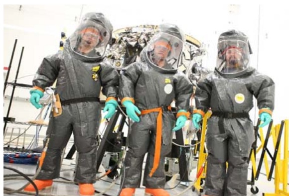
ATA-Aerospace fueling crew in hazard suits preparing to fuel the EAGLE spacecraft (in background).

Mycroft will evaluate the region around EAGLE using a SSA camera. Mycroft will also use its sensors and software to perform advanced guidance, navigation and control functions—key functions in all satellite operations.