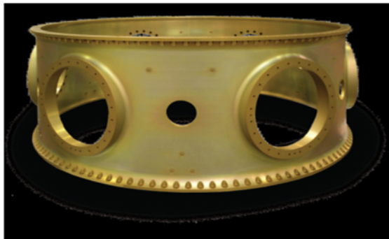
ESPA Ring before payloads added.

EAGLE is a triple-nested acronym that when broken out is: Evolved Expendable Launch Vehicle (EELV) Secondary Payload Adapter (ESPA) Augmented Geosynchronous Laboratory Experiment. ESPA is an AFRL innovative technology that increases the number of satellites that can be put into space on a single launch. Much like a train can just add extra cars to transport more cargo, one or more ESPA rings can be added under the primary payload to launch more satellites.