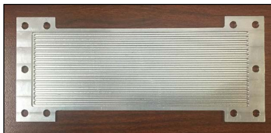
Cutaway of an oscillating heat pipe (OHP) showing its microchannel pattern

Microgravity influence on fluid flow, especially two-phase flow, is significantly different than in a terrestrial environment. This is true for steady-state operations, but is more important for transient operation. In addition, the combined effects of the space environment (e.g. thermal