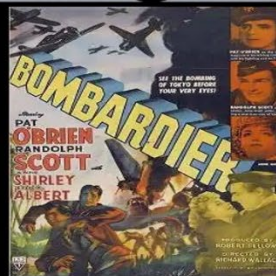
Caption: Movie poster for the 1943 film Bombardier .