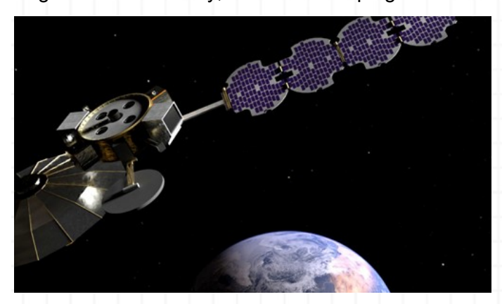
Artist's concept for NTS-3 in geostationary orbit. NTS-3 will be based on Northrop Grumman Innovation System's ESPAStar bus, building on Eagle's flight heritage.

PNT is a key mission area for the Air Force Research Laboratory (AFRL) in New Mexico. Together with industry, we are developing advanced