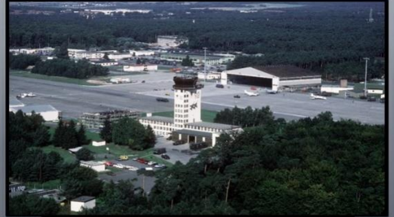
Caption: Ramstein Air Base circa 1985.