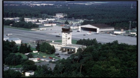
Caption: Ramstein Air Base circa 1985.