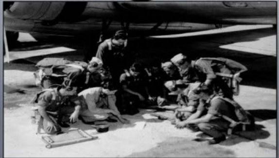
Caption: Bombardier training at Albuquerque Army Air Base ca. 1940s.

https://www.kirtland.af.mil/Portals/52/20240101%20%28U%29%20377%20ABW%20Heritage%20Pamphlet.pdf