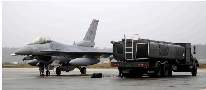
An F-16 Fighting Falcon refuels, thereby demonstrating its dependence on a logistics chain.

RANGRS is currently conducting the space logistics study and compiling all information necessary to generate any type of conclusions. Additionally, the team has written multiple flight proposals in anticipation of the study conclusion. In the meantime, the program is continuing to perform in-house research and contract-out component development work to advance technology and tools that enable space logistics.