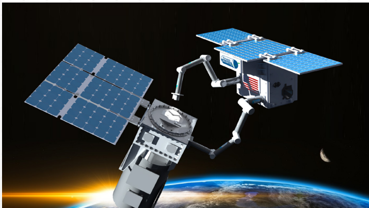
A concept for a generalized two-arm servicer for satellite repair and refuel

Upon conclusion of the space logistics study, RANGRS will start deploying flight tests to demonstrate specific capabilities and conceptual operations of space logistics. These demonstrations will span across multiple flights, demonstrating different aspects of the space logistics chain. Upon successful demonstration of these flight experiments, AFRL will transfer the capabilities and conceptual operations to industry. Industry, in turn, will work with AFRL and the USSF to transition these developments to the operational warfighter.