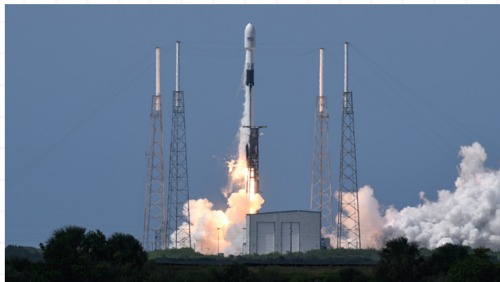
Currently, when a satellite is launched and becomes operational, the USSF does not upgrade or repair the satellite as it is "locked" in its final form. Space Logistics aims to change that paradigm.

The Air Force Research Laboratory (AFRL) is the primary scientific research and development center for the Department of the Air Force. AFRL plays an integral role in leading the discovery, development, and integration of affordable warfighting technologies for our air, space, and cyberspace force. With a workforce of more than 11,000 across nine technology areas and 40 other operations across the globe, AFRL provides a diverse portfolio of science and technology ranging from fundamental to advanced research and technology development. For more information, visit: www.afresearchlab.com .