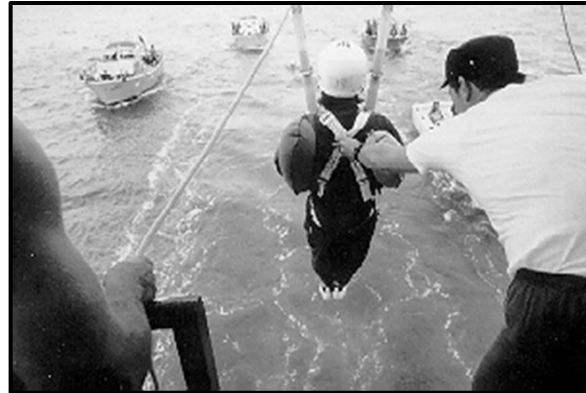
Astronaut Sally Ride prepares to parasail during water survival training, 1977.

The first female survival graduate completed training on 10 August 1970, followed by the first female SERE Specialist graduates in December 1977. The length of the basic SERE course was revised several times during this period, based on changing requirements and available resources, while facilities received upgrades in the late 1980s and computers began to be incorporated into the administration of the training programs by the end of the decade. A detachment at Nellis AFB, Nevada, supported RED FLAG exercises with SERE elements from June 1976-March 1985, one of several joint and service-dedicated exercises that it participated in through the 1980s. During the same period, the wing supported NASA and the Air Force Academy with survival training from its curricula designed to meet the needs of these entities.