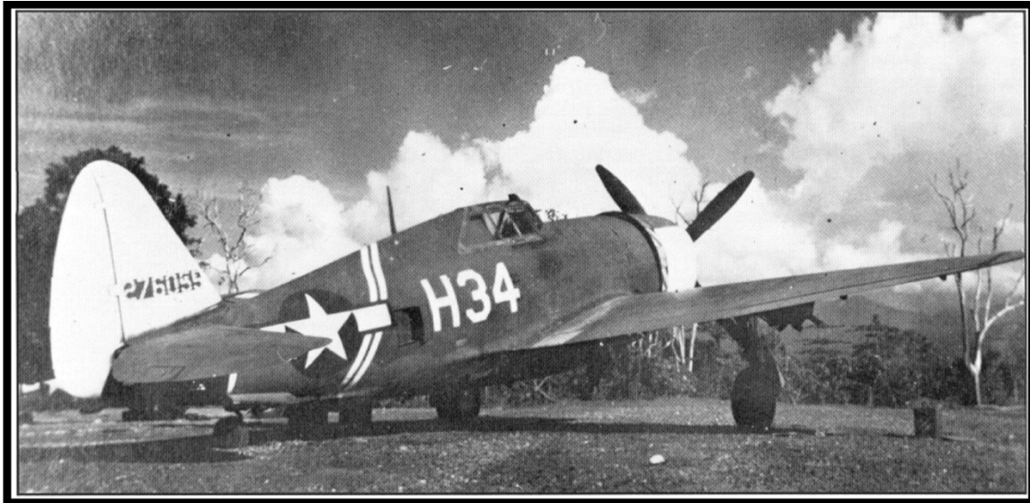
A 58th Fighter Group P-47 serving in the South Pacific.

Between October and December 1943 the 58 FG deployed to New Guinea via Australia. Equipped with the Republic P-47 Thunderbolt, nicknamed "The Jug," the group served under Fifth Air Force. The 58 FG entered combat in February 1944, flying protective patrols over American bases and escorting transports. The 58 FG also provided fighter support for bombers attacking Japanese airfields and installations and escorted convoys to the Admiralty Islands. The 58 FG moved to Noemfoor Island in August 1944. From there, they bombed and strafed enemy airfields on Ceram, Halmahera and the Kai Islands.