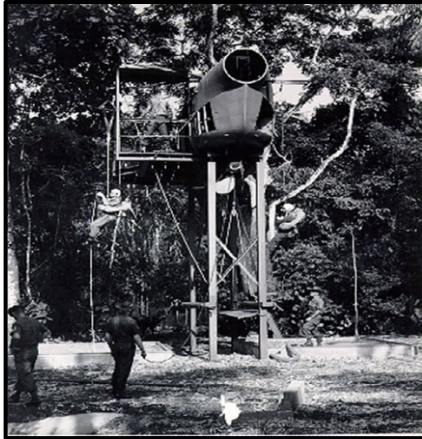
Students use rescue hoist devices at Albroom Air Base, Panama, 1968.