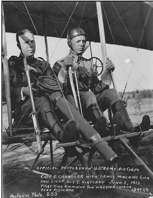
Col Roy C. Kirtland (right) in a Wright 1911 Model B flyer, 1912.

After World War II, with the activation of the US Air Force and the advent of the nuclear age—which Kirtland Field (later, Kirtland Air Force Base in January 1948) had supported with the development of the Manhattan Project at Los Alamos, New Mexico—the military complex transformed into an installation dedicated to the support and research of special weapons and nuclear science. Kirtland AFB provided airfield support for the former Air Depot station, which was taken over after the war by the Atomic Energy Commission and later, the US Army, and re-named Sandia Base around September 1945. The bases were joined in February 1952 by Manzano Base, formed near the Manzano Mountains just to the southeast of Sandia Base.