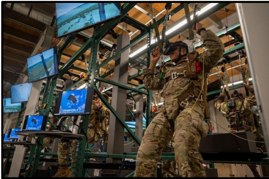
SERE students operate ParaSim virtual reality simulators, October 2023.