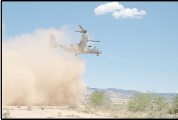
A CV-22 Osprey performs a “dust-out” maneuver during training, July 2009.