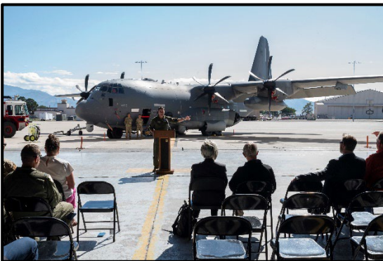
The 58 SOW welcomes its first AC-130J to the fleet, September 2024.