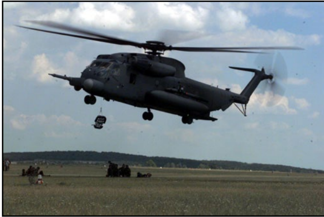
An MH-53J Pave Low III performs a hoist maneuver, 1998. Kirtland aircrews performed operational testing on the first Pave Low III prototype, as well as the aircraft's first search and rescue missions in 1980.

1 October 1991 as the 542d Crew Training Wing (542 CTW). The 542 CTW inactivated in turn on 1 April 1994, becoming the 58th Special Operations Wing. In the same time period, following the passage of the Goldwater-Nichols Act of 1986, the wing's mission evolved to include a re-capitalization of its fleet, and the incorporation of special operations qualification training into the curriculum along with personnel recovery.