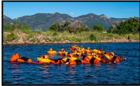
Air Force Cadet water survival training, Kettle Lake, CO, July 2022.