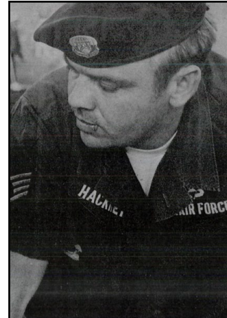
CMSgt Duane Hackney, Air Force Cross recipient and most decorated enlisted troop in Air Force history, trained in the Pararescue School at Kirtland AFB following his re-enlistment in the service in 1977.

In addition to its training mission, the 58 SOW played a vital role in assisting search and rescue operations throughout the American southwest. While training mission-ready aircrews continues to be the primary goal of the 58 SOW at Kirtland AFB, aircrew members are called upon occasionally to support rescue operations in cooperation with civilian authorities. Between 1976 to the present, aircrews from Kirtland AFB were credited with saving over 240 lives and launching over 300 sorties in support of these missions.