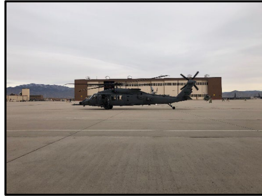
The 58 SOW's first HH-60W sits on the tarmac at Kirtland AFB, December 2020.