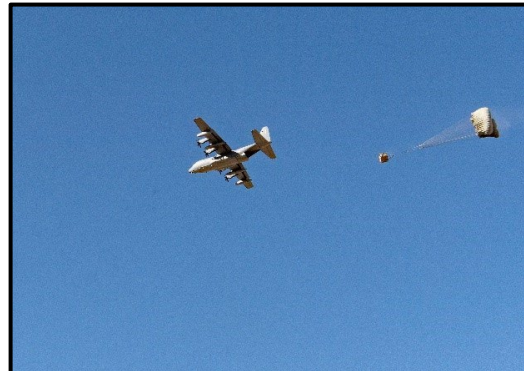
An MC-130J conducts an airdrop over the Howard Drop Zone at Double Eagle Airport, Albuquerque, October 2024.