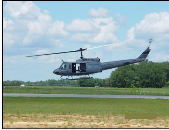
The TH-1H flies an undergraduate helicopter training mission in 2008.

Two other GSUs, Detachment 1 of the 58th Operations Group, and the 24th Helicopter Squadron, operate out of Marine Corps Air Station New River, North Carolina, and Maxwell AFB, Alabama, respectively. 58 OG Det 1 is supported by Marine Medium Tilt-Rotor Training Squadron 204 to provide initial qualification training for CV-22 pilots on the squadron's fleet of MV-22s. The 24 HS currently supports the 902d Airlift Wing of the Air Force Reserve in executing the ongoing beddown of the MH-139 Grey Wolf helicopter, and development of its training programs.