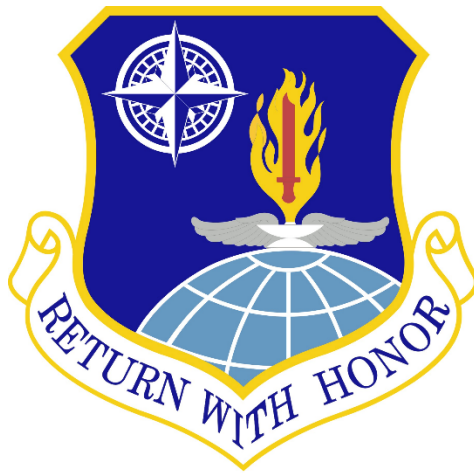
Emblem of the 336th Training Group

The wing's training responsibilities increased substantially in the 2010s when the prestigious 36th Rescue Flight, previously assigned to the 336th Training Group at Fairchild AFB, Washington, was reassigned to the 58 SOW on 1 June 2012. The entire 336 TRG followed suit in August 2013, bringing the Air Force's SERE schoolhouse under the 58 SOW's authority and increasing the wing's number of annual graduates ten-fold. Along with primary operations at Fairchild AFB, overseeing a training support squadron and two training squadrons (TRS), the 22 TRS and 66 TRS, the 336 TRG operates two detachments assigned to the 66 TRS, and one operating location. Det 1 is at Eielson AFB, Alaska, and provides arctic survival training, and at Joint Base San Antonio-Lackland for the SERE Specialist Orientation course, as well as Evasion and Conduct After Capture training for deploying Airmen. 336 TRG OL A is assigned to the US Air Force Academy to facilitate Air Force cadet survival training. The 36th Rescue Squadron, currently assigned to the 58th Operations Group, provides air support for SERE training classes, as well as civil search and rescue requests.