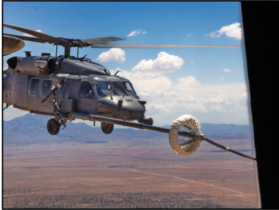
An HH-60G Pave Hawk with the 512th Rescue Squadron at Kirtland AFB, New Mexico performs in-flight refueling from the 550th Special Operations Squadron MC-130P Combat Shadow during a July 2009 training mission.

training to their students in 2004. Since then, the 23 FTS has expanded its curriculums to include training in enlisted aviator fundamentals. In 2024, the squadron consolidated the entire rotary-wing undergraduate pilot training pipeline at Ft. Novosel, with initial flight training overseen by an operating location unit at nearby Dothan Regional Airport.