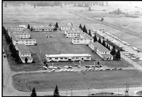
3636th Combat Crew Training Wing complex, Fairchild AFB, 1966.

Experience in SERE-related situations during American involvement in the Korean War led to an expansion of the course to 21 days by 1953, and the inclusion of the Code of Conduct in 1957 as the keystone of resistance training. The school later provided desert training for astronauts assigned to the National Aeronautics and Space Administration, several of whom included major figures in space history such as Virgil “Gus” Grissom and Edwin “Buzz” Aldrin. The Air Force closed Stead AFB in 1966, and re-assigned the survival school to Fairchild AFB under the 3636th Combat Crew Training Group (CCTG) on 1 March, just prior to the base’s closure in June. Other training was carried out by Tactical Air Command at Homestead AFB, Florida, for water survival, and Albrook Air Base, Panama for tropical survival, while Pacific Air Forces conducted jungle survival at Clark Air Base in the Philippines. Curriculums were shortened through the mid-to-late 1960s, in order to quickly process and train Airmen preparing to depart for combat duty in Vietnam.