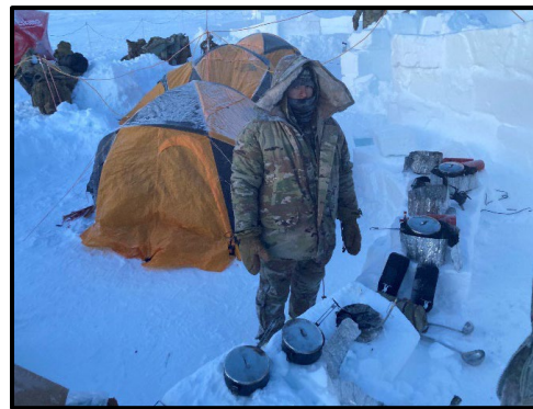
Arctic Survival students melt snow for water, January 2023.

Following its assignment to the 58 SOW on 15 August 2013, the 336 TRG has spent much effort in analyzing and implementing innovative projects to modernize its training programs. These provide SERE students and Specialist technical trainees with more advanced technologies that align with the capabilities of younger generations, who have been far more immersed in computer and communications technology than those who joined the program in the 20th Century and early 21st Century. This has included upgrades to the school's laboratories and academics; the consolidation of all water survival and egress training from NAS Pensacola to Fairchild AFB; the addition of a human performance flight to maximize the physical capabilities of students and instructors, while providing instruction on nutrition and injury management; the re-establishment of the Air Force Academy cadet survival training course in the summer of 2021; cooperation and assistance from local government agencies to enhance training scenarios; and the addition of cutting-edge virtual reality trainers.