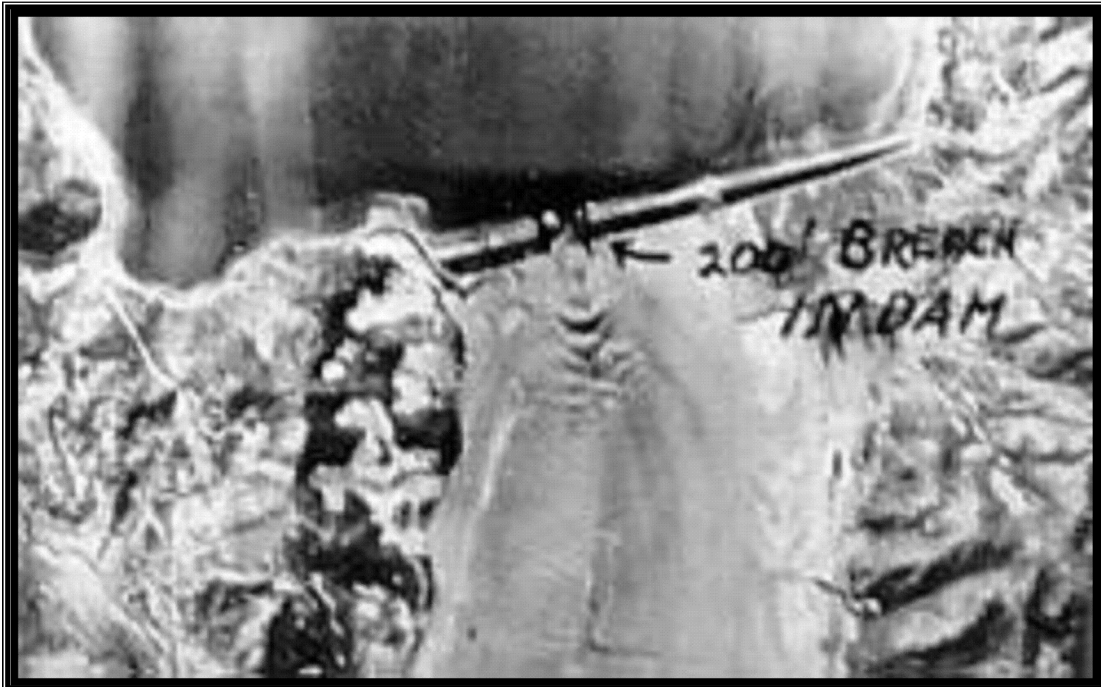
Battle damage assessment of the Chosan Dam in North Korea after a 58 FBW strike in May 1953 revealed a 200-foot break in the dam.

The wing's official history starts with the activation of the 58th Fighter-Bomber Wing (58 FBW) on 10 July 1952, at Itazuke Air Base, Japan, flying the F-84 Thunderjet. The 58 FBW replaced the 136 FBW, a Texas Air National Guard Unit. The 58 FBW moved to K-2 Air Base, later known as Taegu Air Base, South Korea, in August 1952. Fighter-bomber units like the 58 FBW provided close air support for United Nations ground forces. Often flying deep into North Korea's "Mig Alley," the 58 FBW targeted airfields, railways, enemy positions, bridges, dams, electric power plants and vehicles. The 58 FBW fought many battles and inflicted serious damage on the enemy, but these missions were not easy and they came at a cost. By the end of December 1952, the war claimed 18 members of the 58 FBW. By war's end the toll rose even higher. Many wing pilots never came home. According to recent listings from the Defense Prisoner of War/Missing Personnel Office, the fates of 14 members assigned to the 58 FBW are still unaccounted.