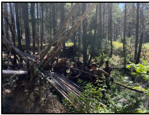
SERE students construct a logpole shelter during Core Survival Skills training, July 2023.