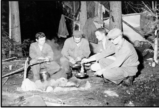
Students in basic combat survival training prepare a wilderness meal, 1953.

schools in Puerto Rico, Georgia, and Ohio. These proved successful enough to justify a larger training campus, leading to the schoolhouse's reassignment to Stead AFB, near Reno, Nevada, in 1952.