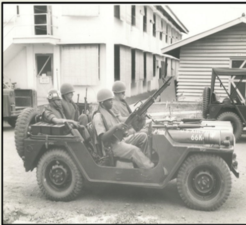
A 377 APS patrol jeep, 1966.