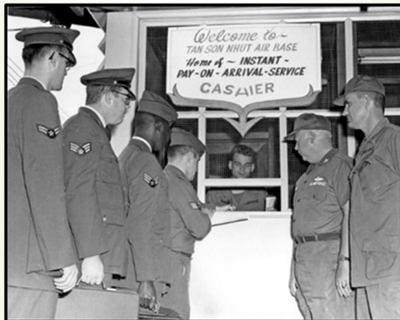
Airmen at Tan Son Nhut Air Base line up to receive their pay.

Jun-Dec 1966: Provided support for Seventh Air Force flying operations involving the Douglas C-47 Skytrain, C-123 Globemaster II, and C-54 Skymaster.