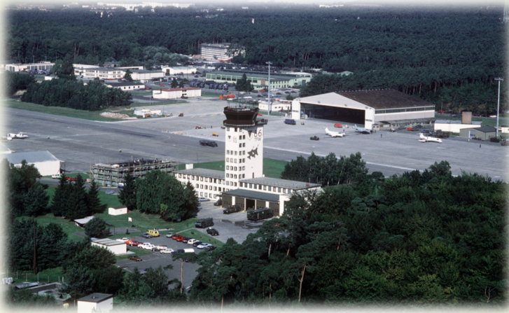
The Air Control Tower at Ramstein AB, ca. 1980s.

1 May 1991: Following the end the Cold War and a general draw-down of U.S. forces globally, the 377 CSW was inactivated.