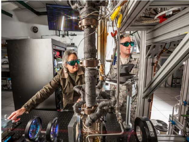
AFRL scientists perform a laser experiment in the Directed Energy Directorate's Diode Pumped Alkali Laser laboratory.

The directorate is organized into divisions by major technology area. Often research capabilities are drawn from several divisions as well as across the whole of AFRL. The four technology divisions are: