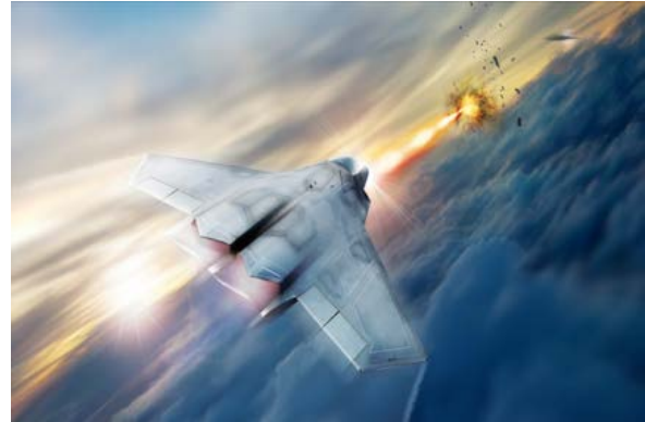
Graphic artist's image of a laser on an aircraft making contact with a target.