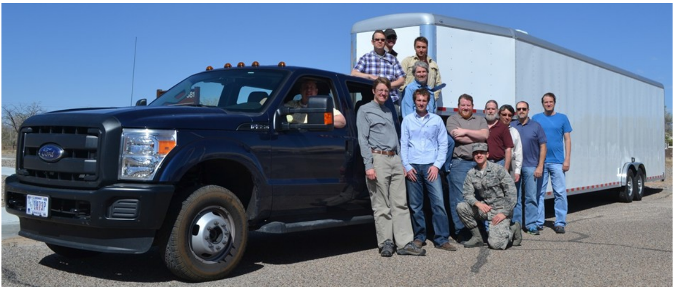
Infrared Radiation Effects Laboratory team at the AFRL Space Vehicles Directorate on Kirtland Air Force Base, N.M. The map below represents the radiation sources where the lab conducts testing.

This independent government laboratory allows for unbiased verification of key performance metrics across multiple space missions and industry providers. The centralized in-house capability is leveraged by system program offices across the government as well as industry partners including but not limited to Lockheed Martin, Raytheon, BAE Systems, and Ball Aerospace who pay operating costs, allowing for lower government cost, higher quality testing, and a broad in-depth view of the state of visible through long wavelength infrared FPA and detector technology.