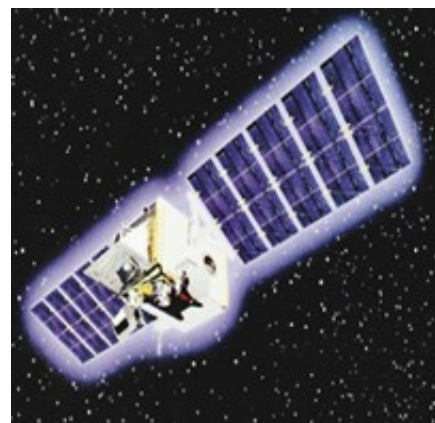
Space Based Space Surveillance (SBSS) used for space situational awareness