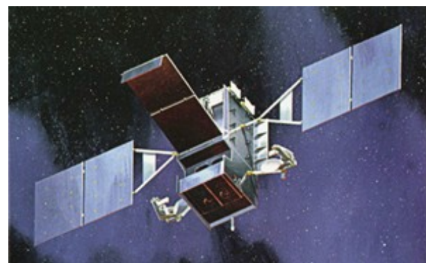
Space Based Infrared System (SBIRS) used for launch detection and missile warning

IRREL provides in-depth detector performance characterization and flight qualification in benign and high radiation environments for all Air Force missile-warning and surveillance spacecraft (SBIRS, STSS, SBSS), Missile Defense Agency, NASA, and Intelligence Community spacecraft. The lab conducts extensive pre- and post-radiation characterization of sensors vital to all National Security Space programs.